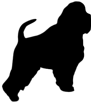
No. This is exaggerated in many ways. Excessive rear angulation, sloping topline; front assembly far too forward; groomed to excess