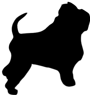
Less than ideal; over-angulated rear; severe underline; short on leg; front heavy; over-groomed.