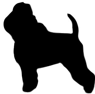
No. Such an appealing image. Correct? No, note exaggerated rear angulation

accept that color continues to change on the “dogs of color” over their lifetime. Most judges have accepted color, as well they should, since the Standard does not discriminate against it.