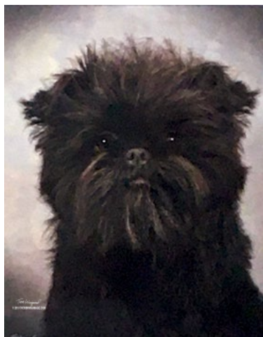
Eyes, round, full, medium size, not prominent.

T ime? Yes, it's time to step back and take a good, long, hard look at the Affenpinschers that are being shown in the rings today. What is being bred, shown, promoted, and rewarded today will influence the direction the breed takes tomorrow. We must, as breed preservationists, objectively evaluate that direction. All breeders, exhibitors (handlers included), and judges must have the strength and courage to maintain BREED TYPE and reverse the direction the breed is currently taking. We are moving away from moderation and forward to exaggeration. We must ensure that "Affens" stay looking like Affens, not caricatures of Affens.