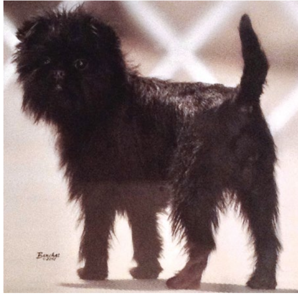
Left: An example of good body-length to leg-length to depth-of-body. Right: A bitch with a well maintained shaggy but neat appearance. This correct coat needs little grooming to blend the various lengths of hair.