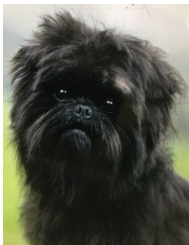
Near perfection for head and expression; Eye shape, color, set, nose, lower lip line. Neat but shaggy appearance.